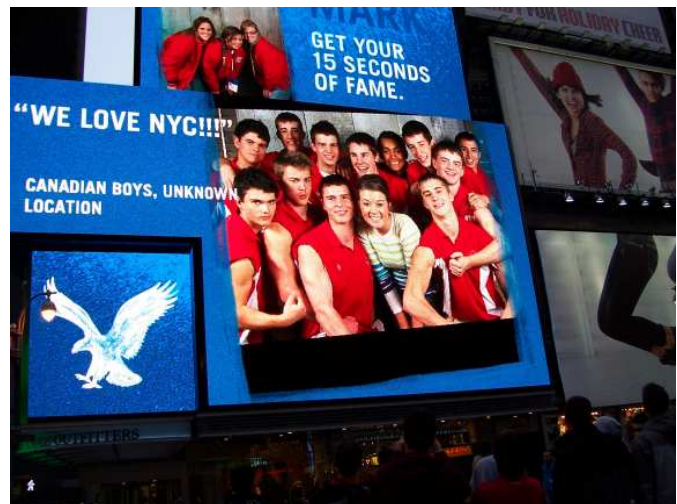
Selects get 15 seconds of fame outside new American Eagle store in Times Square.