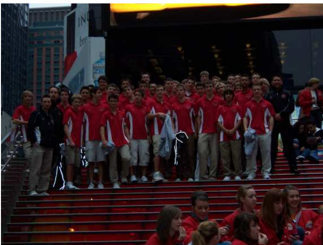
Burnaby Mountain Selects Sophomore and Junior Elite teams visit Times Square in Manhattan, New York.

After the tournament, the Selects spent a day in New York, touring Manhattan and visiting Big Apple landmarks, Times Square, Rockefeller Center and Ground Zero.