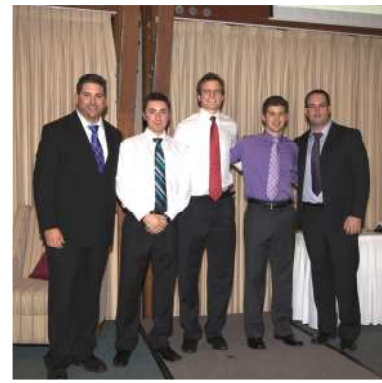
2010 SFU GRADUATING SENIORS