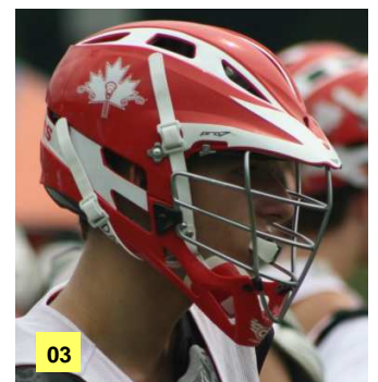
03 – Custom BMS Cascade Pro7

While in Syracuse, the Selects visited the Cascade Lacrosse Factory to pick up their new custom BMS Cascade Pro7 helmets. Announced earlier this summer, as the new "Official Helmet" of the Burnaby Mountain Selects, the top of the line Pro7 with SEVEN Technology is the most advanced helmet Cascade has produced. The new custom BMS helmets were on display for the first time at the Syracuse Summer Shootout and will now be supplied to all Burnaby Mountain Selects athletes when they are selected for the elite touring program.