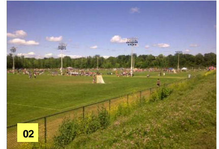
01 – Day 1 (Friday) 02 – Day 2 (Saturday)

With four games on deck for Day 2, sunny skies provided the perfect back drop for lacrosse, while the Selects were thankful for the slight breeze that accompanied the 23 degree heat, with much lower humidity than the day before. Up first was the Albany Power Rising Juniors, a team from the Capital District, loaded with some of the best upcoming talent from the likes of some of New York's other large schools in Section 2, including Niskayuna, Guilderland and Shaker. The Selects would once again open the scoring to start the day, with back-and-forth action resulting in a 3-3 tie at the break. BMS would take a 4-3 lead early in the second half before five unanswered goals resulted in an 8-4 Power win.