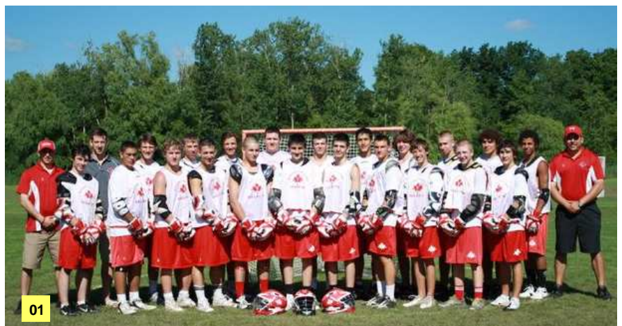
01 – Burnaby Mountain Selects Junior Elite (Grad 2013) team

The action kicked-off on a hot and humid (27 degrees, mid-30's with humidity) Friday afternoon, as the Selects faced-off against Blaze Junior (New York), a team of top players from Western New York, in their first match-up of the tournament. After opening the scoring, Burnaby Mountain would lead 3-1 early in the first half until two late goals by Blaze Junior would see the teams draw even at 3-3 heading into the break. BMS and Blaze would trade goals at 4-4 to start the second frame, before three unanswered goals to end the game saw Blaze Junior walk away with a hard fought 7-4 victory.