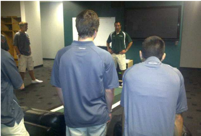
Photo: Walking out of the Locker Room, through the tunnel and onto the field... http://yfrog.com/kfqaajxj