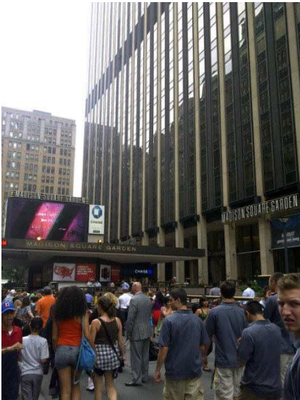
Photo: Selects have arrived at Madison Square Garden / Penn Station... http://yfrog.com/h37vnqdzj