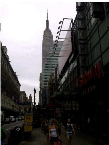
Photo: Walking past the Empire State Building... http://yfrog.com/gzxu8jvj