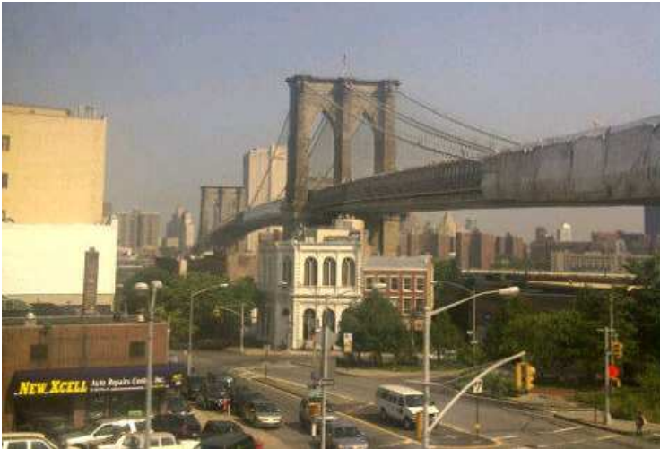
Photo: Passing the Financial District in Downtown Manhattan, from across the Hudson River. http://yfrog.com/kll3dsj

Photo: Driving underneath the Brooklyn Bridge http://yfrog.com/kk4uqvzj