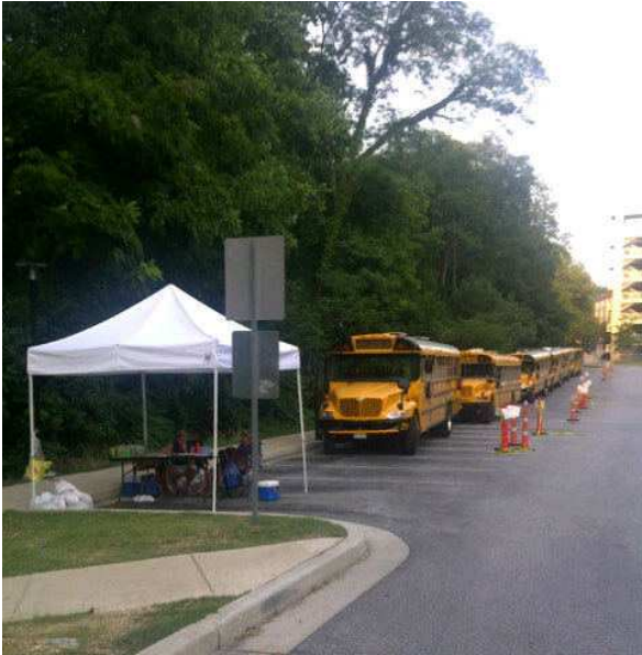
Photo: Champ Camp Shuttle Station at Towson http://yfrog.com/gyfgzsjj

It was another HOT one in Baltimore today. Temperature was mid-30's (high 40's with humidity) and sunny after a brief early morning storm.