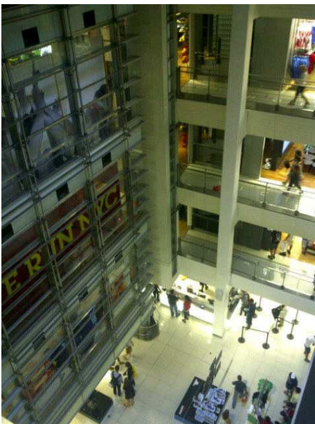
Photo: Inside Nike Town Manhattan; 5 floors from top to bottom of everything Nike. http://yfrog.com/h78idjfi

Italian Football Club Juventus, in New York for a North American tour, is also shopping inside Nike Town with the Burnaby Mountain Selects!