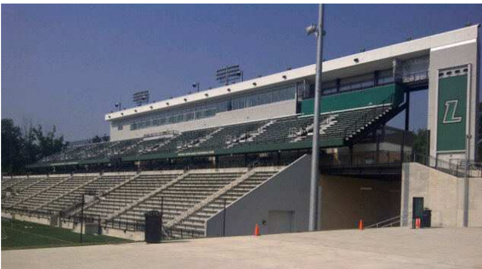
Photo: Outside of Loyola University's Ridley Athletic Complex. http://yfrog.com/kg58vsqj