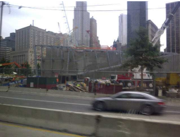
Photo: Construction of the new Freedom Tower at Ground Zero http://yfrog.com/h8quolgj

Photo: Driving by Ground Zero... http://yfrog.com/h0bftcj