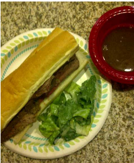
Photo: Dinner Day 6 - Beef Dip served with Au Jus and Sweet Onion Salad. http://yfrog.com/h4g6flvij