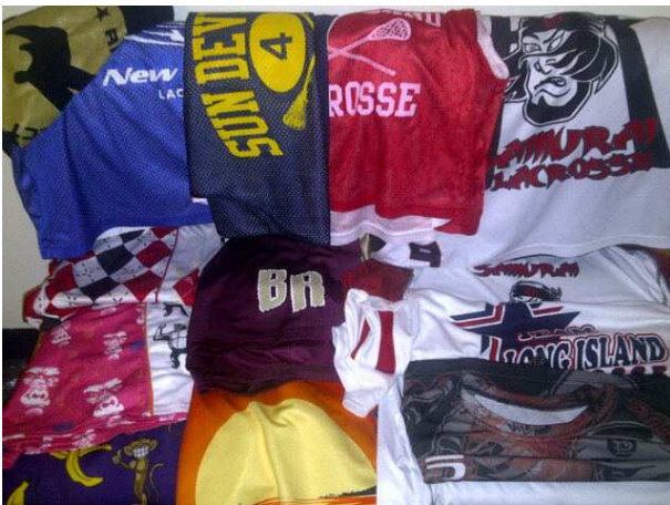
Photo: Selects are heading to bed after an action packed night of "trading" in the Towson Dorms! http://yfrog.com/h06uwfyj

ITINERARY UPDATE: Maryland coaches are unavailable tomorrow so we will now be going to the Baltimore Orioles (MLB) baseball game at 1:35pm.