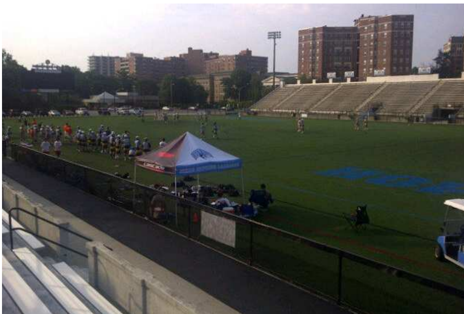
Photo: Homewood Field, home game field of the Johns Hopkins Blue Jays (NCAA DI) men's lacrosse team. http://yfrog.com/kfd38zpj