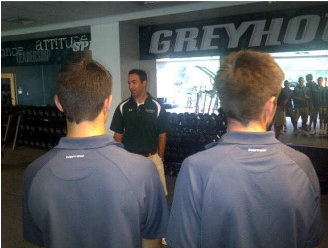
Photo: Inside the Men's Lacrosse Locker Room http://yfrog.com/kfa5mlpj