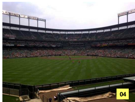
04 – View from the bullpen of Oriole Field at Camden Yards.