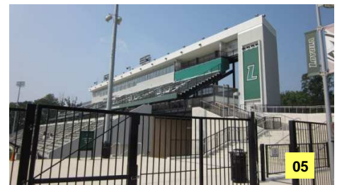
05 – Ridley Athletic Complex