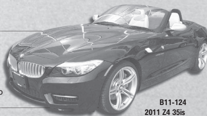
B11-124 2011 Z4 35is

NOW $64,900 MSRP $72,210 2.9% OR $774 /mo