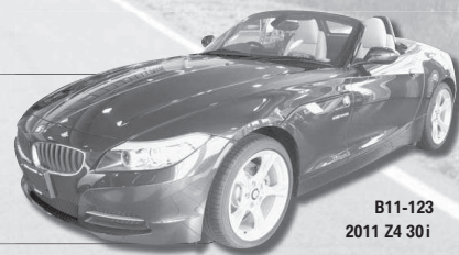
B11-123 2011 Z4 30i

NOW $57,900 MSRP $64,900 2.9% OR $692 /mo