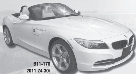
B11-170 2011 Z4 30i

NO CHARGE SCHEDULED MAINTENANCE 4 YEAR/80,000 KM