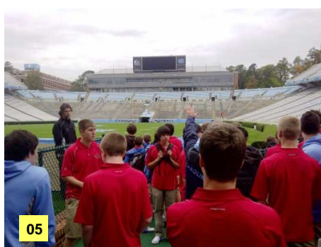
05 – Selects field level inside Kenan memorial Stadium.