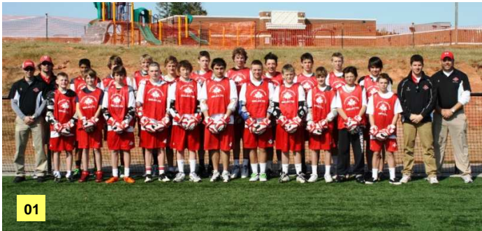
01 – Burnaby Mountain Selects Freshmen Elite (1997) Team