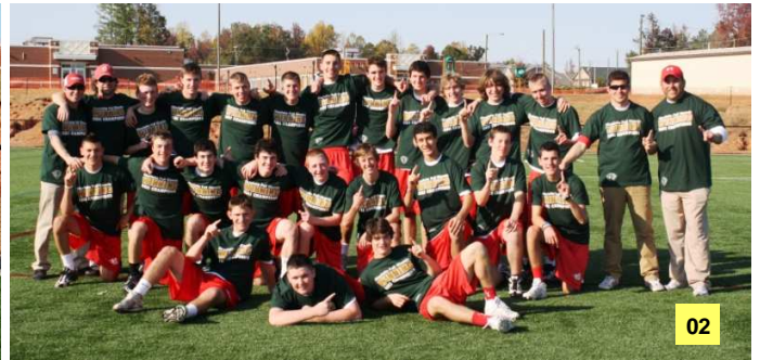
02 – BMS Junior Elite (1995) Team – 2011 STX HS Division Champions