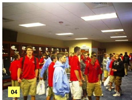
03 – Selects inside North Carolina's new Film Room. 04 – Selects inside the new UNC Men's Lacrosse Locker Room.